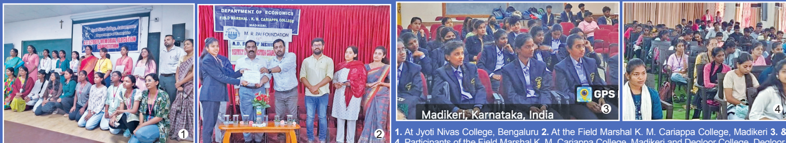
1. At Jyoti Nivas College, Bengaluru 2. At the Field Marshal K. M. Cariappa College, Madikeri 3. & 4. Participants of the Field Marshal K. M. Cariappa College, Madikeri and Degloor College, Degloor