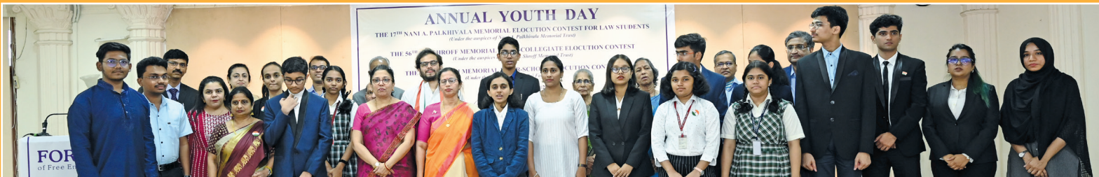
Participants in the Annual Youth Day.