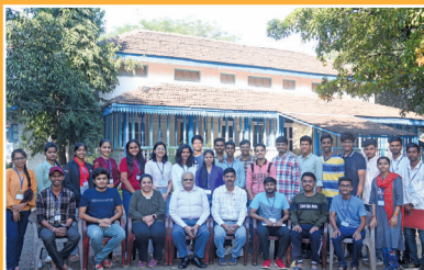
Participants, trainers and others at the residential leadership training camp at Devlali held in December 2022.