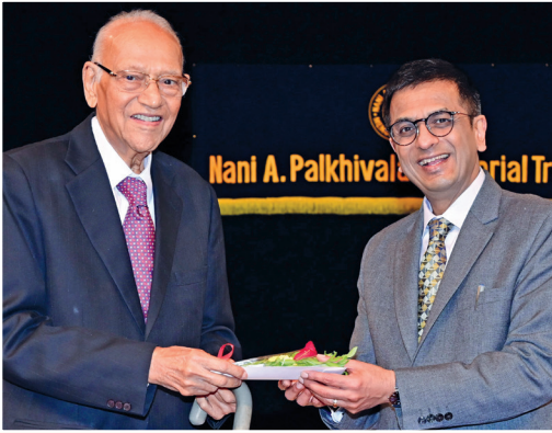
Mr. Julio F. Ribeiro (I) receiving the Nani Palkhivala Civil Liberties Award (Individual's category) from Hon'ble Dr. Justice D. Y. Chandrachud.