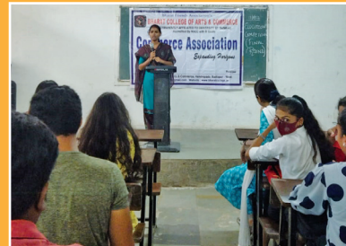
At the Bharat College of Arts & Commerce, Badlapur.