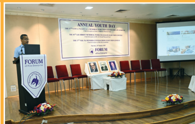
Display of new website.