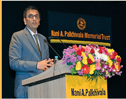
Hon'ble Dr. Justice D. Y. Chandrachud delivering the 18th Nani A. Palkhivala Memorial Lecture.