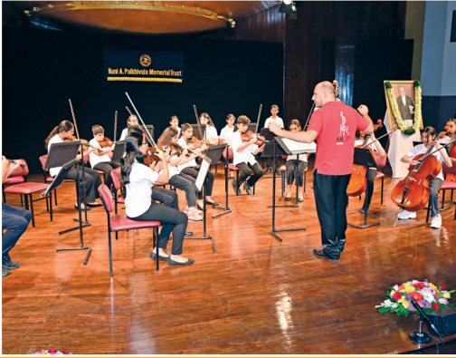
Live performance by SOI Academy Orchestra