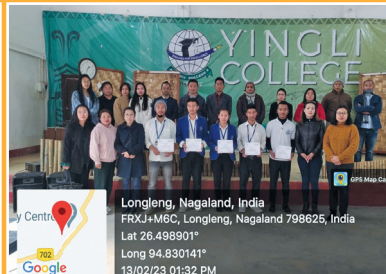
Participants of the Yingli College, Longleng, Nagaland.