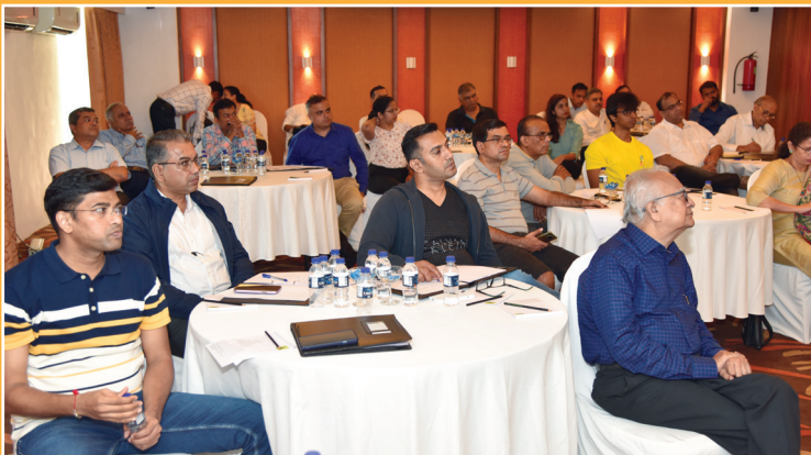
A view of the participants at the program