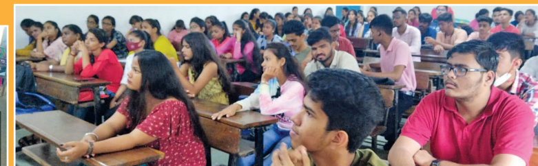
Audience at the competitions held in various colleges.