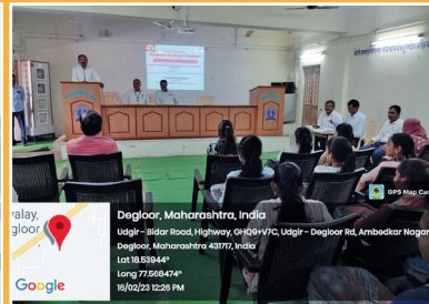
At the Degloor College, Degloor.