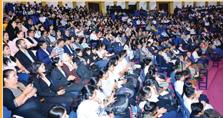
A view of the large audience